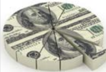
© 2020 TAX NEWS & TIPS